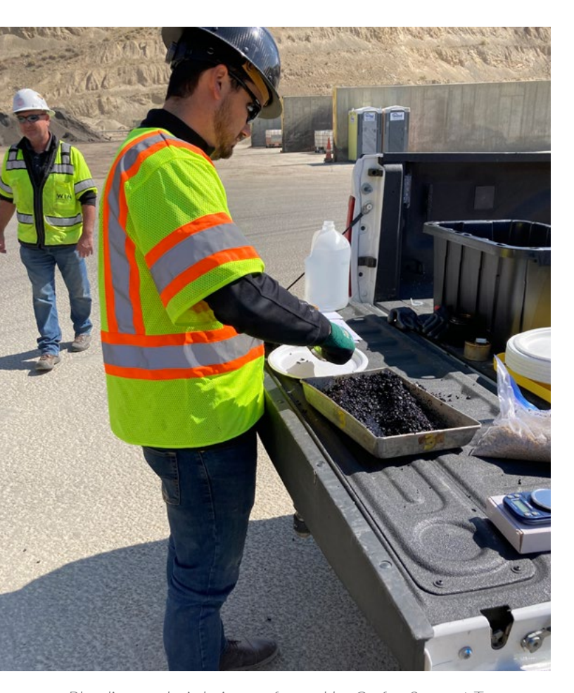
Blending analysis being performed by Crafco Support Team.

At APAC, a producer with locations across Kansas, Crafco's HP ER Enhancer program has provided cost savings and environmental benefits. Branch manager of